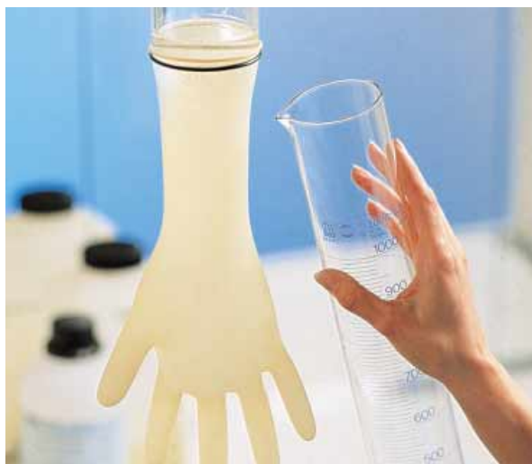
Water retention test

Air testing, another test during which the glove is blown up at a defined pressure and checked for perforation is however a non-destructive test procedure and can therefore be used for the entire production quantity. It must however be