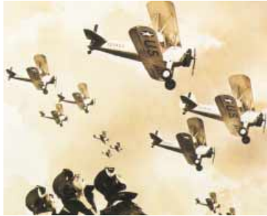
Already in use during the second World War: the US - Military Standard 105-D

Today's AQL has developed over the years, from this test method.