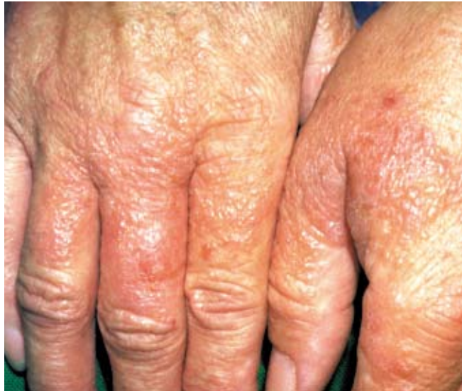
Allergic type IV contact excema ( Releasing agent: Thiurames)

In this case the first symptoms appear approx. 6–8 hours after contact with an allergen, which can increase up to 4 days after removal of the allergen. The type IV allergy is transmitted via T-lymphocytes. It appears as allergic contact excema with papules, blisters, dis-