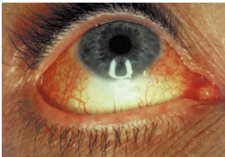
Konjunktivitis (Contact urticaria Syndrome stage III)

The following factors contribute to the development of pseudo allergic reactions and skin irritations: